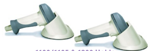
1100/1105 & 1200 Holder